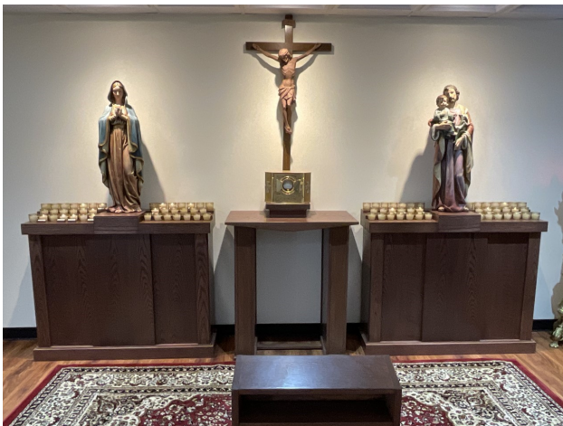
Sanctuary Area of the New Chapel

Exposition Tabernacle, new statues of Mary & Joseph, Kneeler and Altar table, Sanctuary Rug, and two new Memorial Candle Stands.